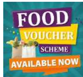
Free school Meals

It is so important that you apply for benefit related Free School Meals if you think your child is entitled. The entitlement to Free School Meals also results in additional funding for the school in the form of Pupil Premium. This funding plays a key role in creating an enriched learning environment for our children. Moreover, if you qualify for free school meals, you'll receive £15.00 per week in food vouchers during holidays.